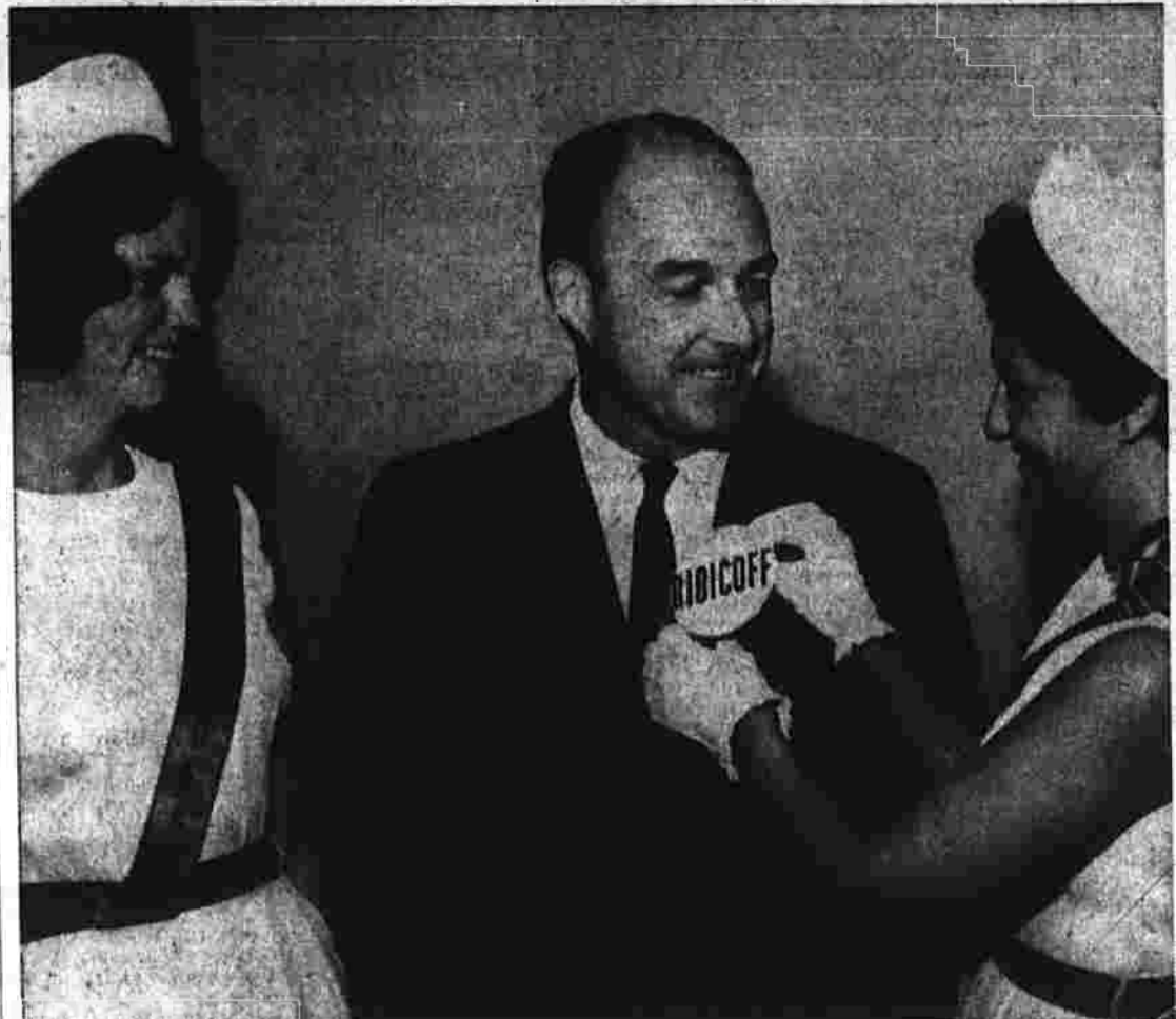
One, Two, Three, Four, Who Are We For

Color guards of Anderson-Shen Post and Auxiliary, P.V.W., will march in 22nd anniversary parade at Coventry tomorrow at 10 a.m. in preparation for the parade at Manchester to take place in the line of march.