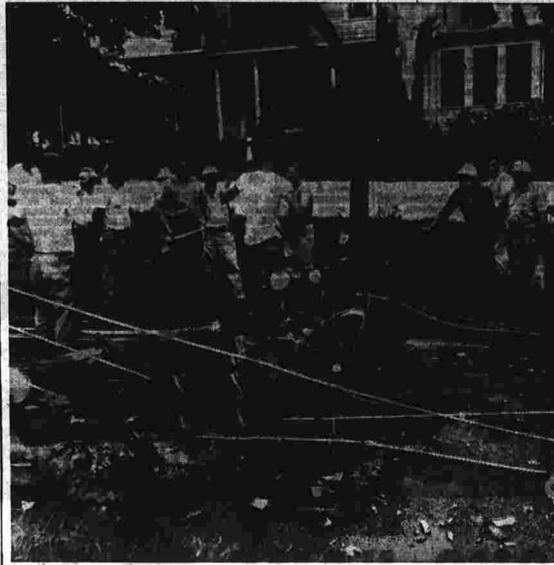
Power was out in a wide area of the North End after this tree fell and knocked down a pole on N. Main St.